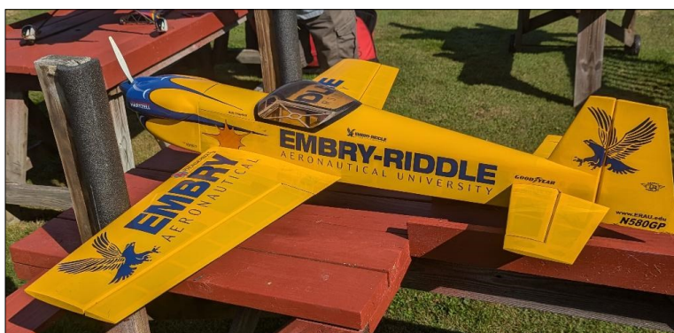
Jeff's Great Planes CAP 580