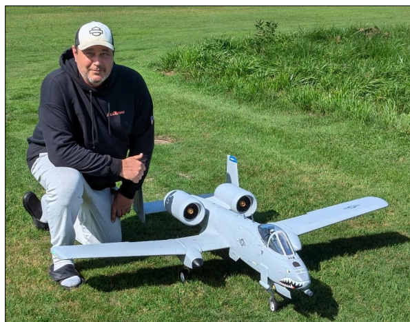
Foamy A-10 Thunderbolt with 80mm EDF fans