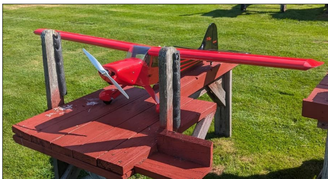
Frank's new Sig T-Clips flew great on its maiden flight.