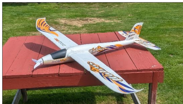
Ken's Hobbyking Walrus glider. Gliders shouldn't be named after a Walrus...