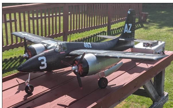
A foamy Tigercat paid a visit