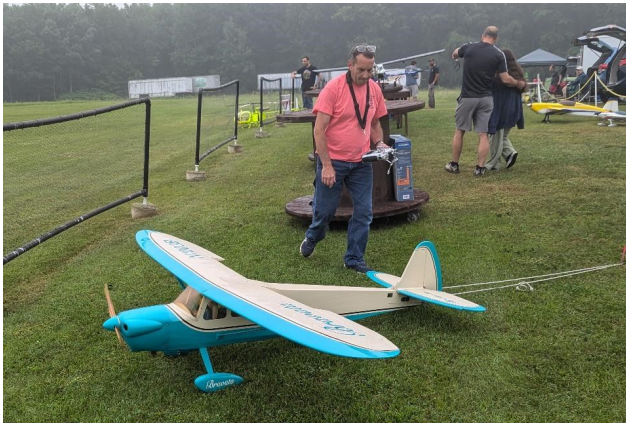
Beautiful old-school Bravada