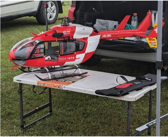
One of two scale helicopters on display