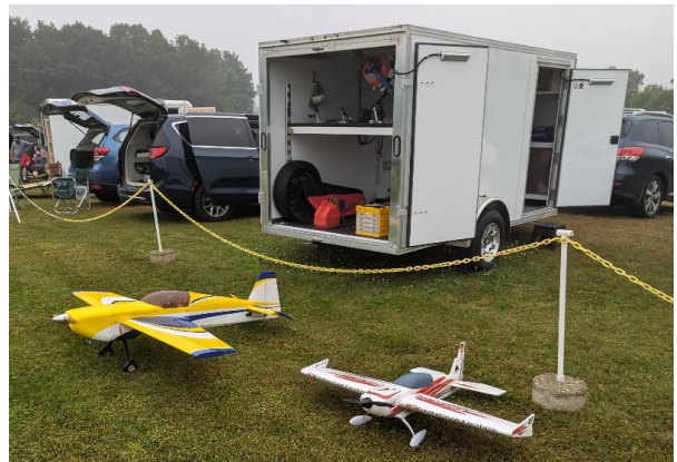
Stunt planes and trailer