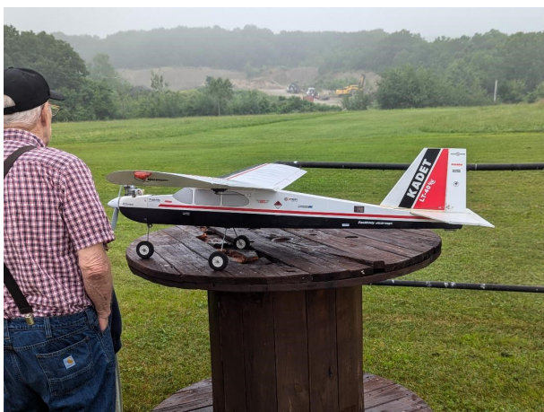
Sig Kadet with a nice, new paint job