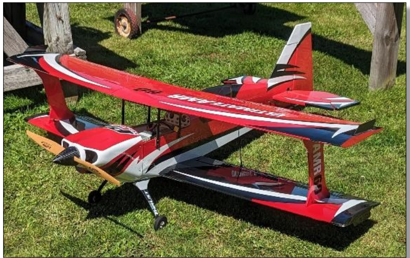
Jeff's AMR 60 Biplane