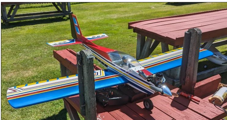
Mark's Sport Plane