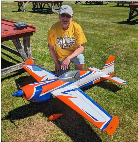
Mark's Extreme Flight Extra 260