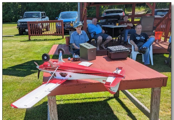
Don's Turbo Beaver after recovery operations