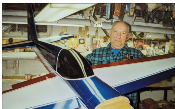
1994—Ace Extra 230. Quadra .50 motor (3 1/2 Horsepower), 96" wing, monocote covering, Bennet Smoke system. Twenty pounds. Owned by Larry Beck, built by Lew Parish.