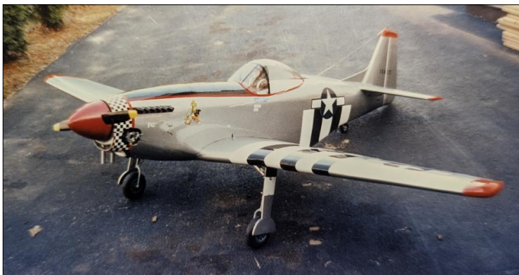
December 1991—P-51 Mustang built by Lew Parish. 102" wingspan, 28 pounds. 4.5 horsepower Quadra Motor, Robart retractable landing gear. Winner of the 1992 Scale Show at Portsmouth High School.