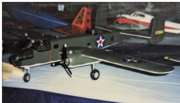
1968—B-25 Bomber with twin K&B .40 motors. Mall Show in Newington, NH.