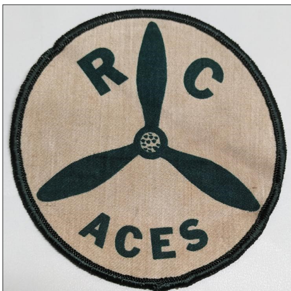
1970's era logo