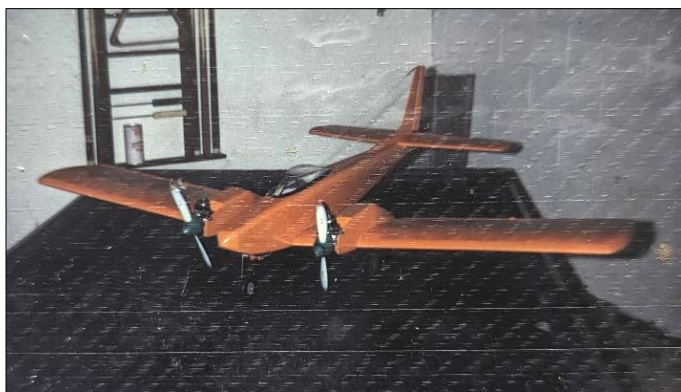
1973—Twin engine Skylark. Two O.S .15 motors.